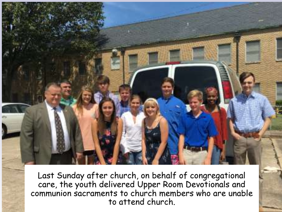
Last Sunday after church, on behalf of congregational care, the youth delivered Upper Room Devotionals and communion sacraments to church members who are unable to attend church.